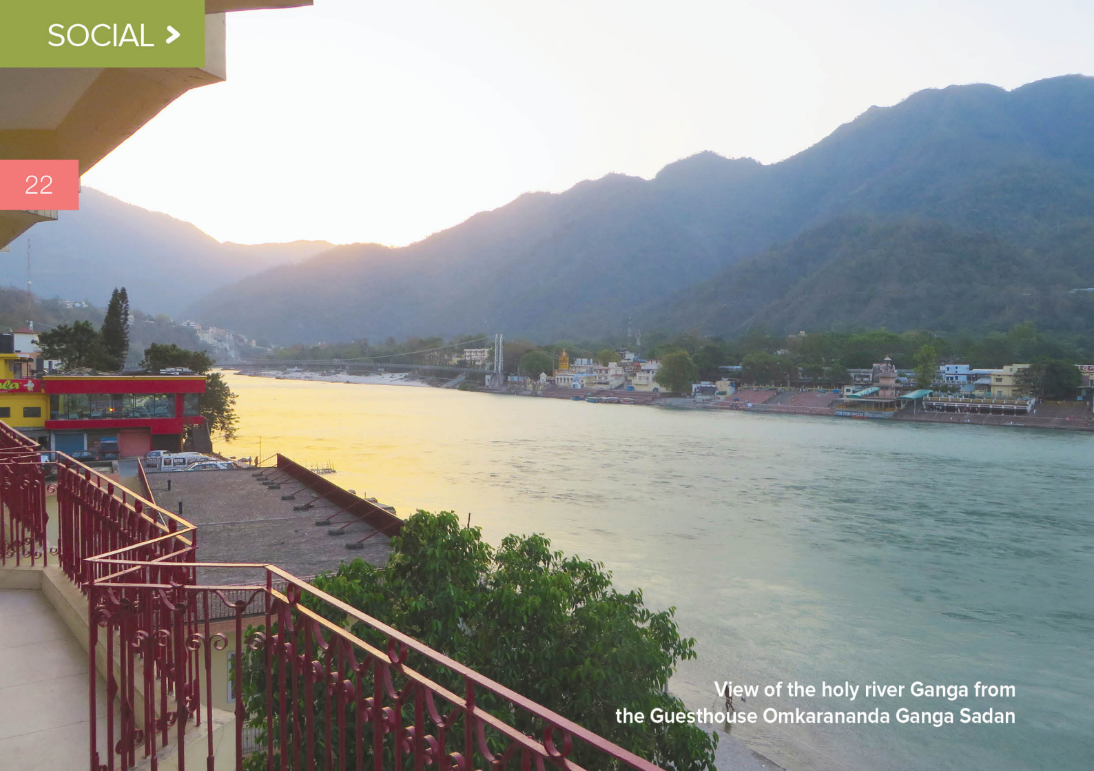
View of the holy river Ganga from the Guesthouse Omkarananda Ganga Sadan