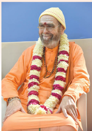
Mahant Shri Swami